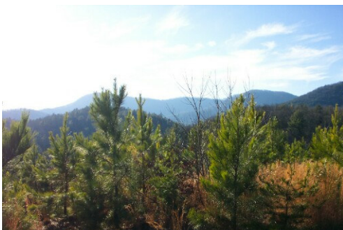
Part of the almost 360° - View from the North Ridge