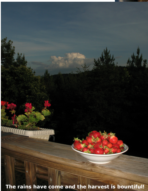
The rains have come and the harvest is bountiful!

Greetings in the name of the One we love to serve most, our Lord Jesus Christ.