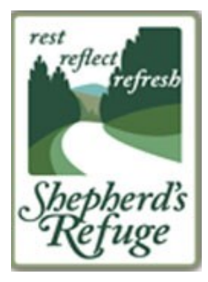
P.O. Box 1221 Dahlonega, GA 30533

Phone: 404-474-0686 Fax: 706-865-6801 Email: info@shepherdsrefuge.org