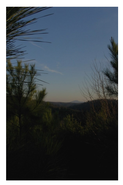
See the "mountain" from a distance!

Send your checks to: Shepherd's Refuge—Selah Ministries P.O. Box 1221, Dahlonega, GA 30533