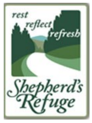
P.O. Box 1221 Dahlonega, GA 30533